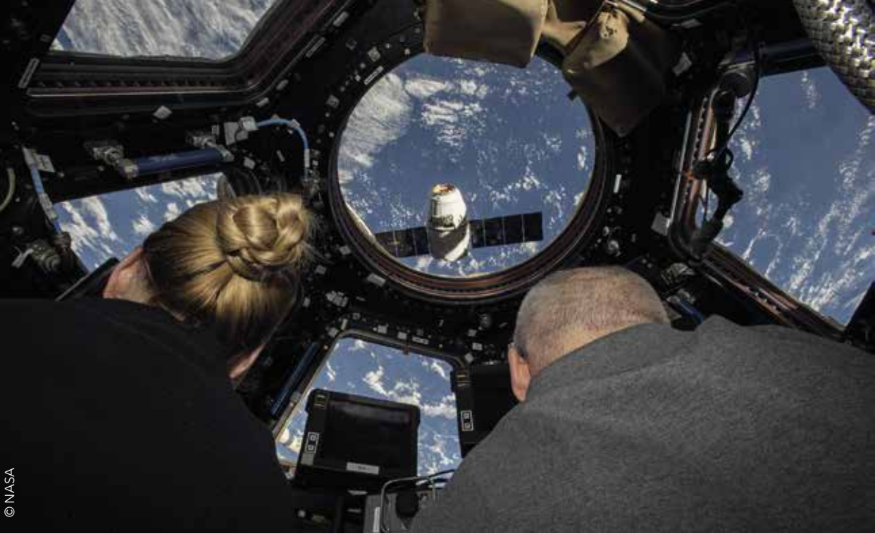
Astronauts aboard the international space station grapple aboard science supplies and hardware, including instruments to perform the first-ever DNA sequencing in space.